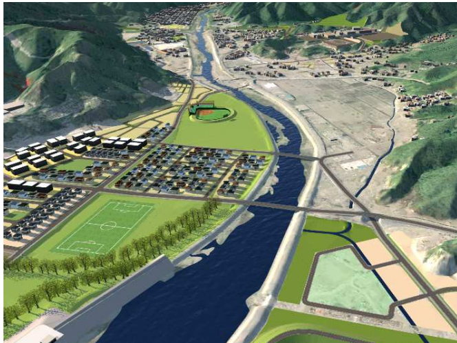
3D Reconstruction plan

Tomoya Ito (Hachinohe Institute of Technology)